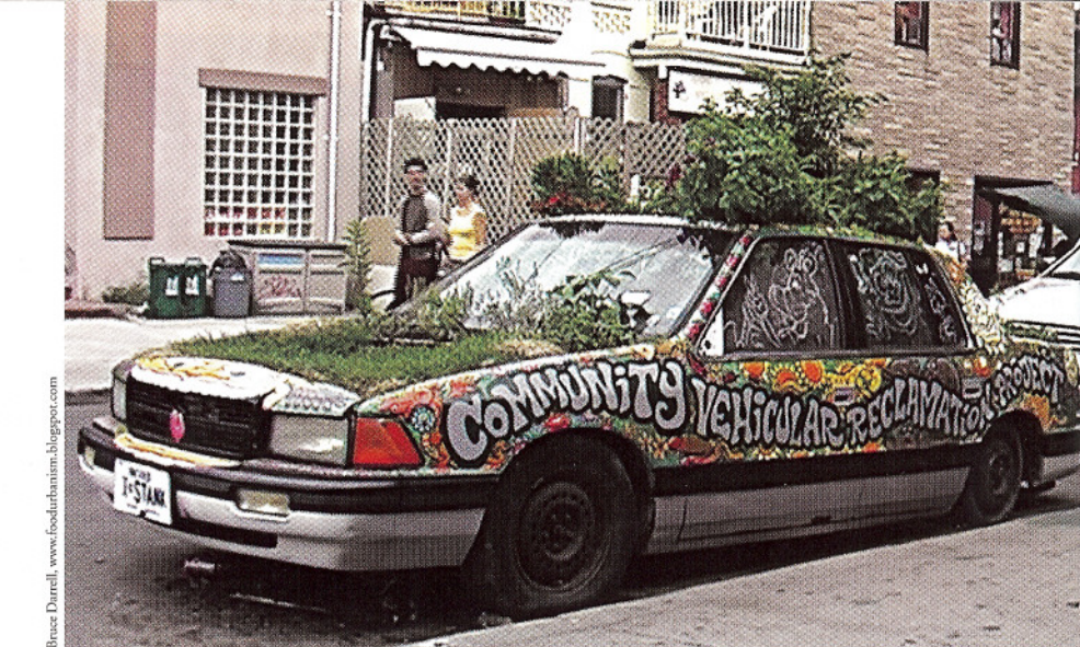
Bruce Durrell, www.foodurbanism.blogspot.com

A good first step for local governments is to create districts that remove hurdles to mixed use developments. They can do much more, how-